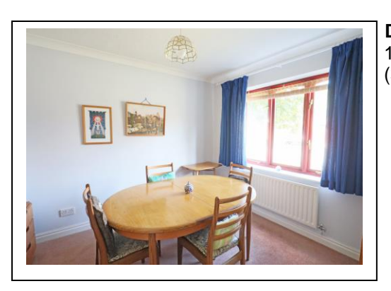
Dining Room :-11' 2" x 9' 2" (3.44m. x 2.84m.)